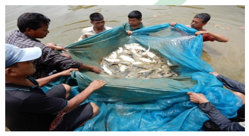
Fish production through composite fish culture (a trial in Tripura)

Aquaculture is a major source of income and employment for thousands of people in Northeast (NE) India. Ponds and tanks are the main water resources where this aquaculture is in practice. As per the latest data published by the Handbook of Fishery Statistics (2020), Ministry of Agriculture and Farmers Welfare, total resources available under ponds/tanks in NE India are 150422.5 ha. Majority of these ponds are small and backyard in nature with an average size 0.08 ha and depth 1 m. Based on decomposed layer and plankton productivity, these ponds can be broadly classified into three types, such as type A (bottom decomposed layer is 15-30 cm, optimum plankton turbidity and other parameters; ideal pond for fish culture), type B (almost absent decomposed bottom layer with low plankton turbidity and low organic carbon level) and type C (high organic load; >30 cm plankton turbidity, low pH, high eutrophication/ algal bloom formation). Most of these water bodies are very fertile and yet to reach final fertility stage however, their average fish productivity (1.5 MT/ha/year) is far below the national average estimated to be 3 MT/ha/year. A number of factors could be made responsible for it but one of the major factors is not targeting the water bodies with appropriate or proven technologies.