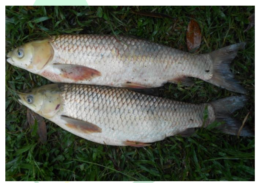
Grass carp, a aquatic weed-controlling fish

are available but their use is not recommended as they leave residual effects on fish and other non-target organisms and minimizes the pond productivity in the long run. Weeds can be kept under control using herbivorous fishes such as Grass Carp (Ctenopharyngodon idella), Goramy (Osphronemus goramy), Silver barb (Puntius gonionotus), etc. Suggested stocking rate for grass carp is 200-300 numbers (500-600g)/ha. Shaded plants and leaves, falling plantation on pond dikes, hanging tree branches, etc should be removed. If the pond is high on organic matter, their soil should be regularly raked with a soil raking device (could be made indigenously) or exposed to sunlight until it cracked.